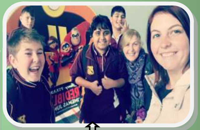
The Incredibles 2 Gold Class